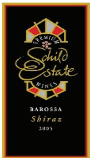
Schild Estate Barossa Shiraz