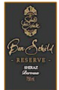
Schild Estate Ben Schild Reserve