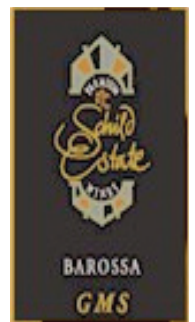
Schild Estate GMS